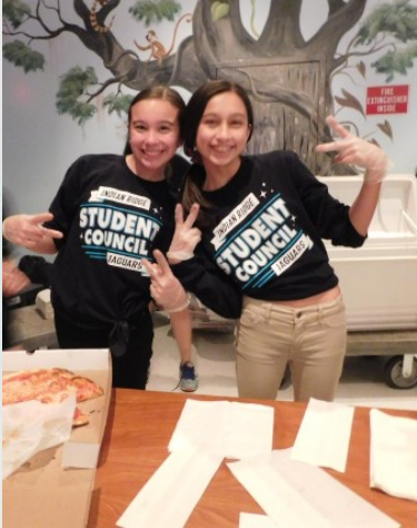
Two members of the Student Council are handing out pizza to people at the dance.