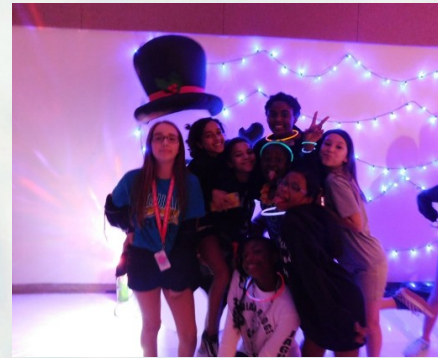
Indian Ridge students posing next to the snowman at the dance.

This year, Indian Ridge held a winter dance on December 6th, hosted by the Student Council and PTO. At the dance, there was music and snacks, with lights adorning the wall. Many students that attended the dance were sixth graders looking to have some fun, since they have never experienced it. There were so many people there that pizza sold out within the first fifteen minutes! All and all, the dance was fun, students reported. There were many instances of dance circles and students running around. A student council member reported that putting together the whole dance was very fun but hectic. Student Council hopes for an even bigger success next year.