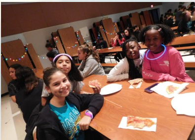
Sixth graders hanging out and eating pizza at the dance.

This year, Indian Ridge held a winter dance on December 6th, hosted by the Student Council and PTO. At the dance, there was music and snacks, with lights adorning the wall. Many students that attended the dance were sixth graders looking to have some fun, since they have never experienced it. There were so many people there that pizza sold out within the first fifteen minutes! All and all, the dance was fun, students reported. There were many instances of dance circles and students running around. A student council member reported that putting together the whole dance was very fun but hectic. Student Council hopes for an even bigger success next year.